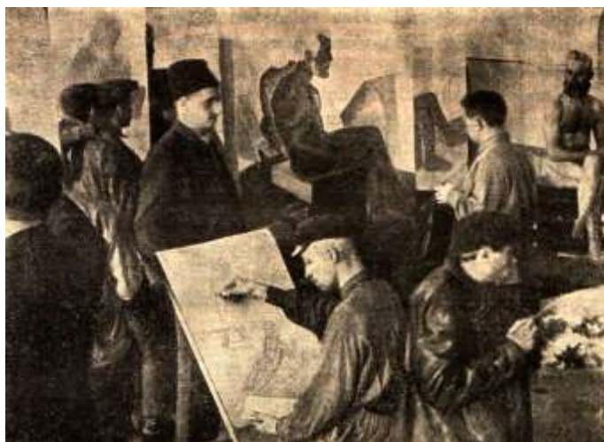
Fig 2. Classes at the art-pedagogical department.