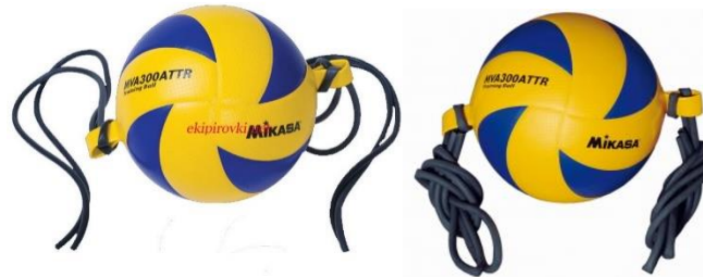
Fig. 1. Trainer "hanging balls"

receiving from the bottom of one and two hands no place, in the fall, falling on the chest and thigh.