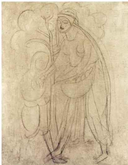
Fig. 5. M. L. Boychuk "Near the Apple Tree", 1912, graphite pencil, cardboard, National Art Museum of Ukraine, Kyiv

The modified figurative symbols of H. Skovoroda in the works of Ukrainian artists, first of all, the boychukists, reflected the idea of the Ukrainian Sacrum'y, the mythological conceptual scheme of the World Tree, when this symbol acts in the ethnoarchitectonic origins and the visual "visual" scheme: the upper, mountain world: sky, sun, moon, dawns, birds; medium earth world: hut, heart, soul; the lower, and beyond, world: gate, serpent, etc., which testifies to the identity with the national-religious outlook following collective and national memory.