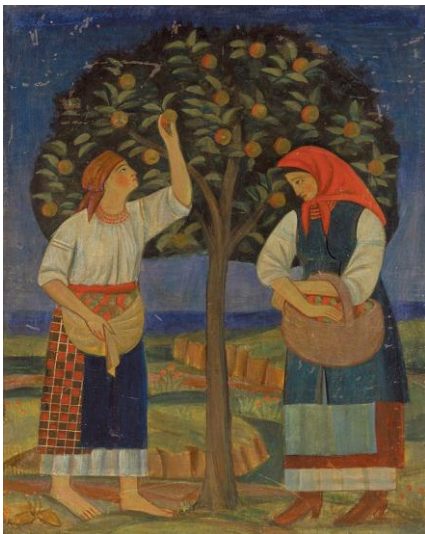
Fig. 3. T. L. Boychuk "In the Apple Tree", 1920, cardboard, tempera, National Art Museum of Ukraine, Kyiv.