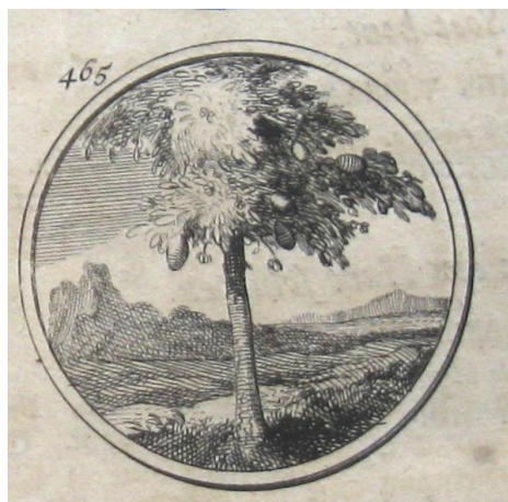
Fig. 2. Snippet from the book «Symbola et emblemata selecta», Amsterdam, 1705. This publication inspired Skovoroda to his philosophical reflections on the magical image of Apple.

H. Skovoroda presented a whole theory of emblems in his works, moreover, he often accompanied his manuscripts with emblematic drawings and short descriptions or «mottos», which contained the philosopher's most beloved ethical thoughts. For a traveling philosopher, the relation to the world was formed by understanding the man's essence, and it was the thinker's symbolism which was brought up in the bosom of Ukrainian nature. While traveling, H. Skovoroda preached his ideas among the common folk, and his philosophical and aesthetic views were closely linked with the spiritual traditions of Ukrainian life, found understanding and spread both in the region and far beyond, influencing the development of the spiritual culture of Sloboda Ukraine, which could not but be reflected in iconography.