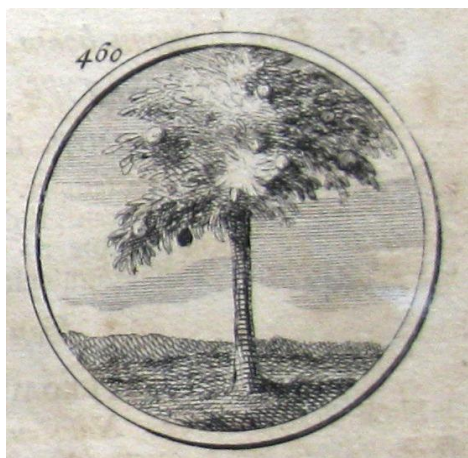
Fig. 1. Snippet from the book «Symbola et emblemata selecta», Amsterdam, 1705. This publication inspired G. Skovoroda on his philosophical thoughts about the magical image of the Yabluny.

Thus, in his works, H. Skovoroda linked the microcosm of a man with the macrocosm of society through the world of symbols, as mentioned in such works as "Narkis", "Melody", and others. According to the philosophical teachings of H. Skovoroda "about the symbolic secrecy world", the indivisible "visible" and "invisible" nature transforms it into a special plexus of "figures" and "symbols" [5]. H. Skovoroda taught students to "get into the depths of the image-symbol, to realize its inner, hidden essence" [6] (Figs. 1 and 2).